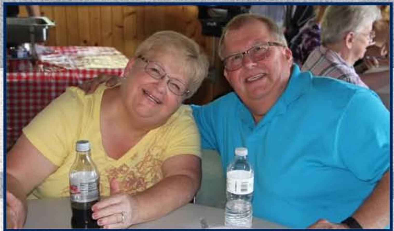
The Annual Corn Feed is always a fun time. Many people come up early to help with the shucking and cooking of the corn. Everyone has their fill of corn, even the little ones.