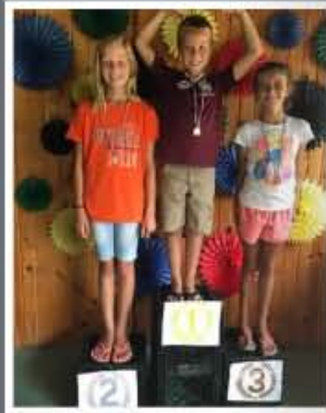
With the Rio Olympics taking place this summer, I thought that a summer olympics for kids would be fun. We enjoyed fun games like the hurdles, the sticky cotton ball pick-up, the cookie roll, pool noodle javelin, and ping pong ball bounce. We finished the party off with pictures on the winners platform.