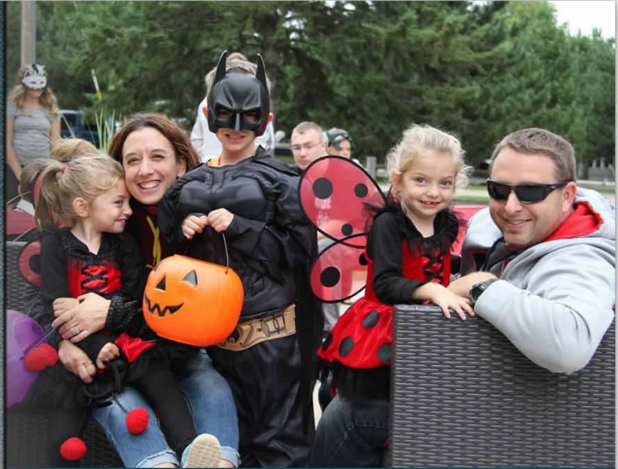
Over Labor Day, kids and adults enjoy dressing up and getting candy from the many seasonal campers who decorate and sit outside their campers watching the unofficial parade. This year the Flintstones, Kenny Rodgers and Dolly Parton, and the Super Moms joined in on the fun.