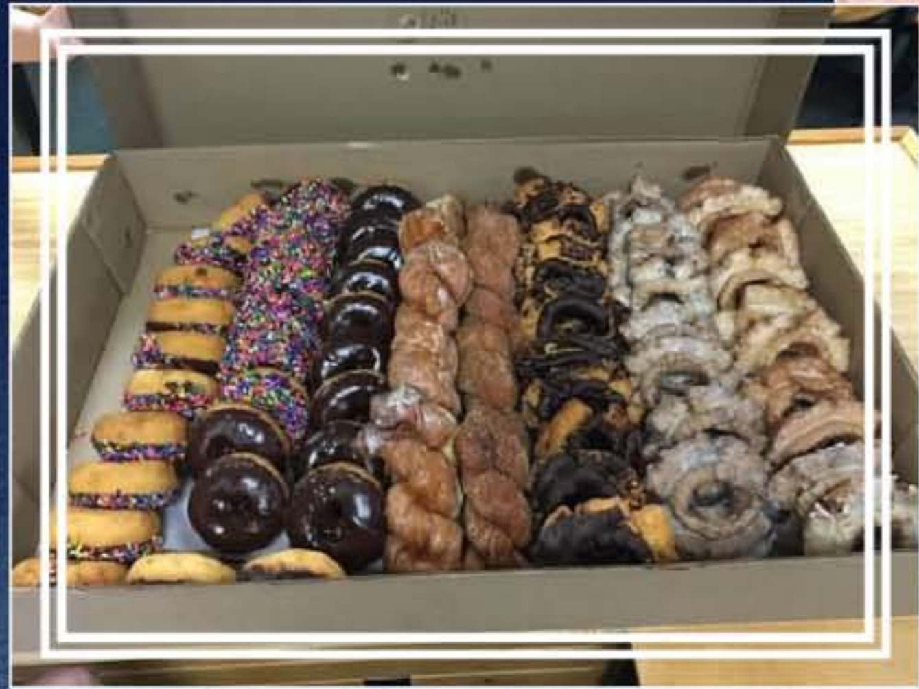
Tuesday mornings at the campground always began with coffee and donuts at the Lodge. Later in the evening we would gather for games of Fast Track.